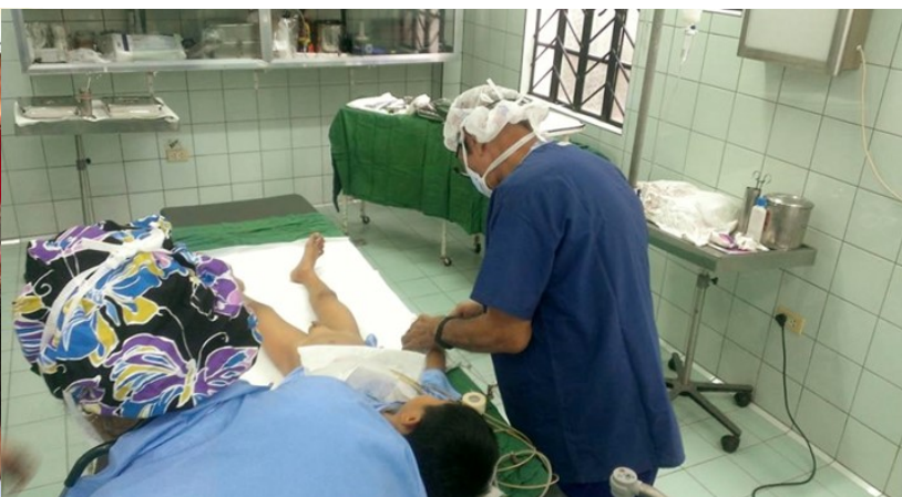
Major surgery at Laguna Provincial-San Pablo District Hospital

did not go back and stayed there illegally to find opportunities that was not available in the Philippines. He does not have a regular source of income.