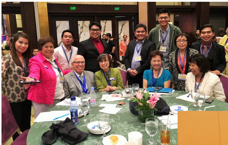
Scholars with PNASD Officers & Members