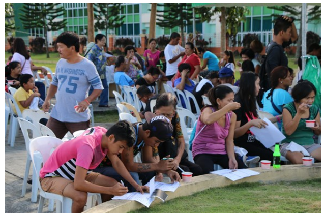
Congee provided during registration at San Pablo City General Hospital

Being a Sunday, the two buses we were riding had a hard time traversing the narrow asphalt road to the Shrine due to traffic congestion. In fact, the 30-minute bus ride from the National Shrine to San Pablo ended up being a two-hour trip. For a balikbayan like me, I considered it an opportunity to enjoy the countryside backdrop of the bus trip plus the smiling faces of our kababayans as they engaged in their mundane activities along the road. The luxuries of the US and the convenience of States-side lifestyle was, suddenly, a thing of the past. I remember one of the APPO volunteers, a Polish nationality and first time visitor to the Philippines,