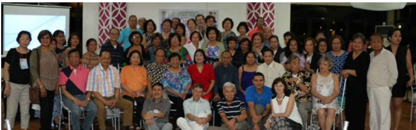
Farewell Party sponsored by the City Government on the last night of the Mission

The first few hours of the Mission was initially chaos. This was expected. It soon became a smooth operation like clock-work once everything settled. There were two hospitals that were used by the Mission. The bigger Laguna Provincial-San Pablo District Hospital housed the major surgery and the smaller San Pablo City General Hospital was used for everything else (minor surgery, medical consultation, pharmacy, optometry and health screening). I was assigned to the triage department with four other APPO volunteers. There was also a group of local nurses helping with triage. I was impressed on how labor intensive this Mission was. A command post was set-up to assist. And thanks to good planning on the part of the local counterpart organization, the volunteers were easily identifiable by their lanyards with their name and designated roles. They were readily available to help both the patients and APPO volunteers. I mean, from accompanying patients to the next station in queue to serving coffee and snacks and anywhere in between. No task was too small for them. They readily provided service, and with a smile too. In fact, one of the local volunteers told me that they do not mind performing tasks that is outside their assigned roles. Everyone was ready to be a constructive part of the Mission!