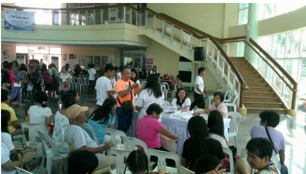
Queue for medical consult at San Pablo City General Hospital

needed to be oriented to the different way of doing things. By the end of the Mission, he became accustomed to using the stairs to his third floor room since there was no elevator in the hotel where we were staying, using the electric fan when the air-conditioner started having problems (almost on a regular basis) in his room, timing his morning showers before the hot water reserve runs out and having a ready sanitizer at hand since running water is not always a guarantee.