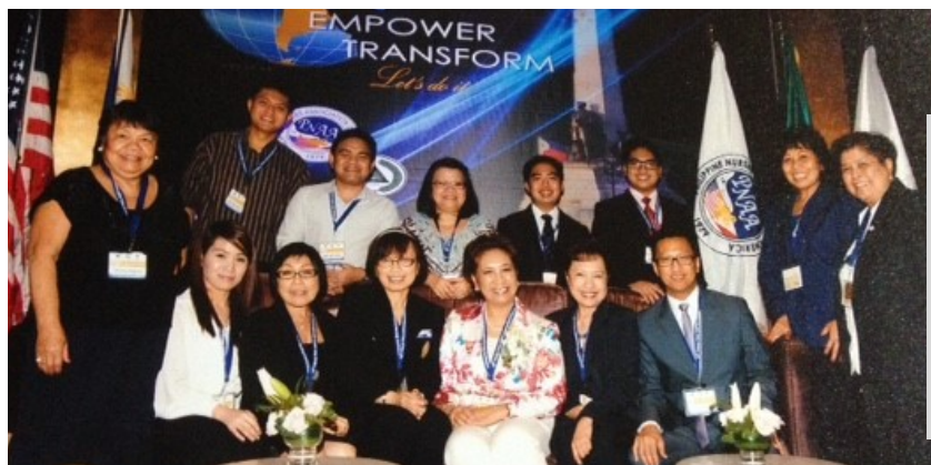
PNASD delegates with Scholars